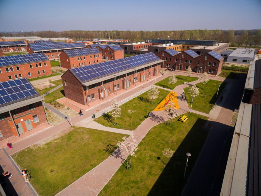
Headquarter of the Immigration-Naturalization Service (IND)