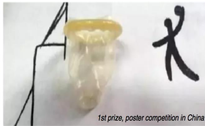
1st prize, poster competition in China