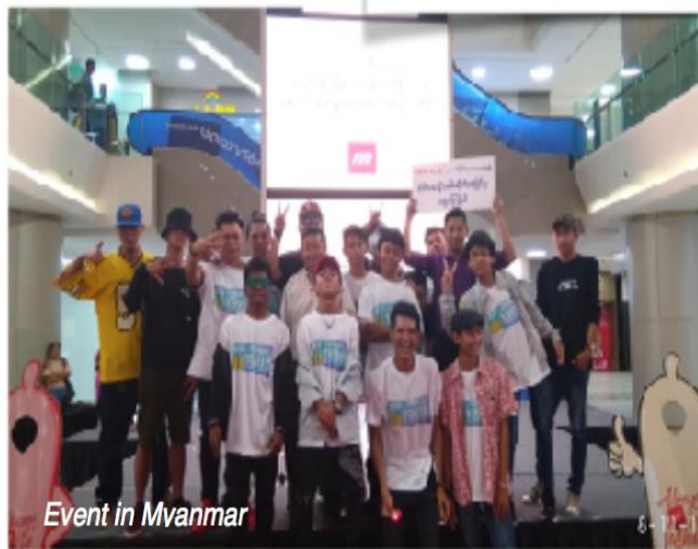
Event in Myanmar