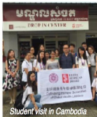
Student visit in Cambodia