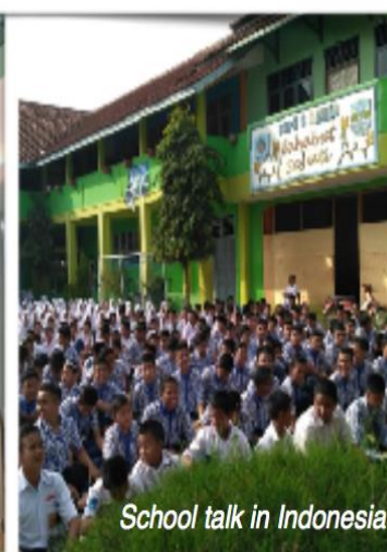
School talk in Indonesia